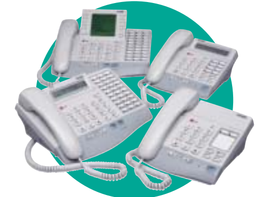
LG LKD Handsets

successful business communications, and the LKD range of Digital Key Telephones gives you the necessary speed, efficiency and features to build a competitive advantage. LKD is more than just a telephone - it's an advanced communications tool.